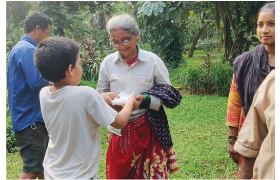
Children give away sandwiches to the Colaba Woods Garden workers