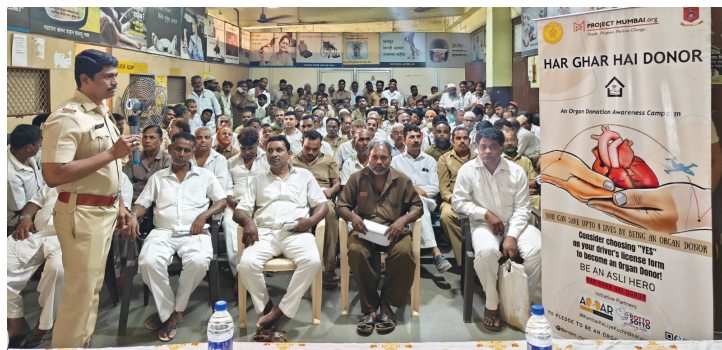
A houseful attendance at the RTO Organ Donation Awareness Campaign

Recently, less than a five-year old's organs were donated and we have also heard of people in their seventies donating. With increased