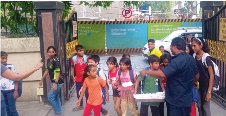
AXF children excited to celebrate the Daan Utsav

At the Angel Xpress Foundation, we encourage our students to celebrate Daan Utsav . What does that embody? A celebration of selflessness, kindness and the act of giving. We at AXF Cuffe Parade celebrated by making our students experience the joy of giving. The students made and distributed 200 Chutney and Jam Sandwiches as a way of thanking people around them who go unnoticed and are under-appreciated. The garden security, cleaners and the maalis ; as also the watchmen from nearby buildings. It was a real feel-good experience for our students.