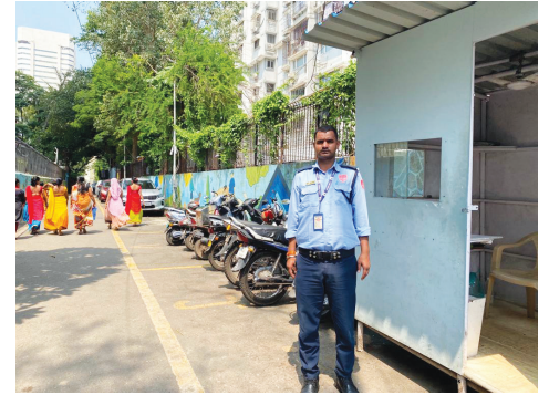
The well-guarded lane maintained by Jupiter and Venus