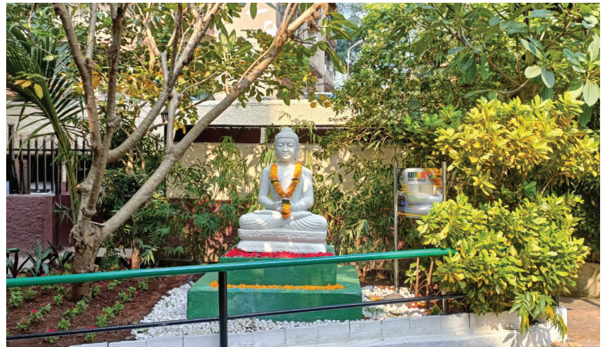
The Peaceful Buddha Statue at the BVM Garden Entrance